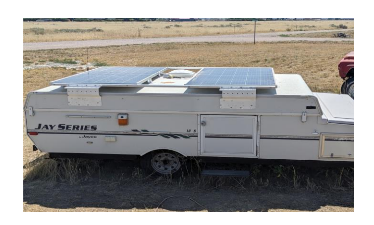
Capital City Amateur Radio Club

kick-stand kit from Costco ($300), upgrading to the 3-panel 55w unit a few years later ($240), then I moved to a 100w roof mounted panel ($100+$30 PWM) with plastic stand-offs glued to the fiberglass roof. I would still put the 55w kickstand out in the sun, but realistically the 100w roof panel did all I needed most of the time and was zero maintenance.